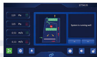
Display for BSC-4FB2-GL

Color Touch Screen Touch operation, real-time and clearer display of various values and appointment timing function.