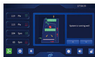
Display for BSC-4FB2-NA